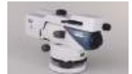
Optical Micrometer OM5 (B20)