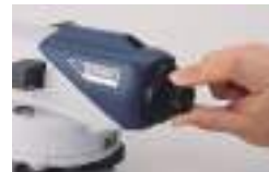
40x Eyepiece EL5 (B20)