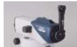
Diagonal Eyepiece DE16 (B20)